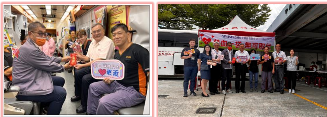
Chairman Supports Corporate Blood Drive