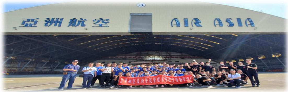
The Department of Management of the Air Force Institute of Technology visited