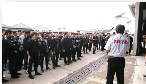
The Department of Aviation Mechanical Engineering of China University of Science and Technology visited