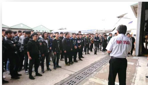
The Department of Aviation Mechanical Engineering of China University of Science and Technology visited