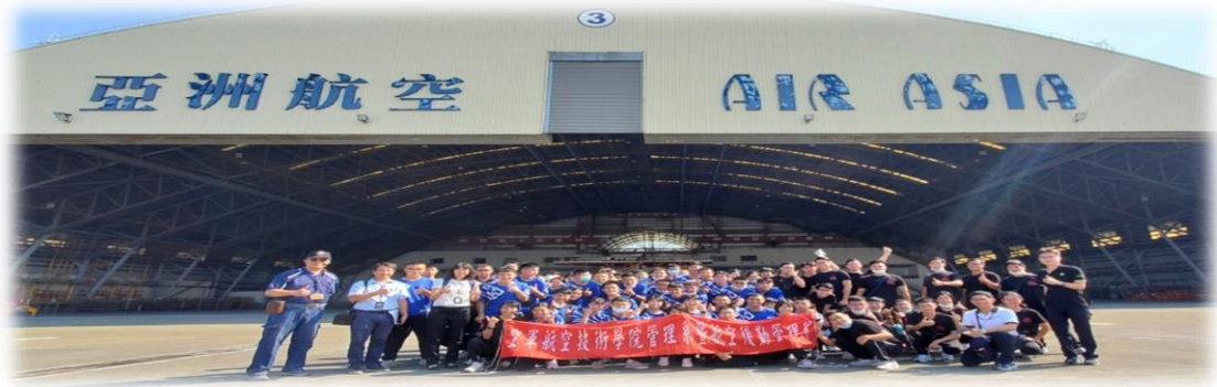
The Department of Management of the Air Force Institute of Technology visited