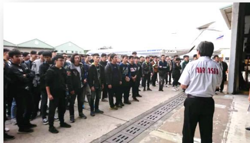
The Department of Aviation Mechanical Engineering of China University of Science and Technology visited